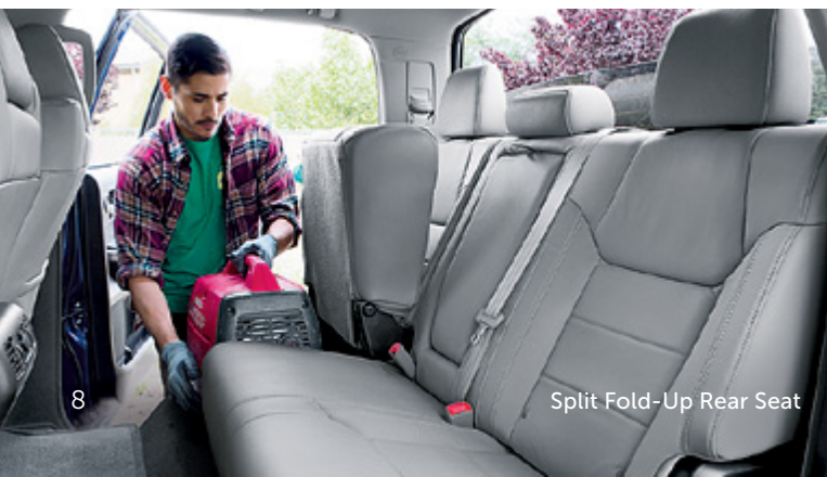
Split Fold-Up Rear Seat

4x4 Double Cab SR5 Plus Long Bed shown in Silver Sky Metallic.