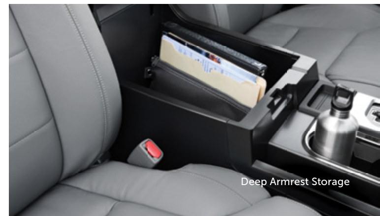
Deep Armrest Storage