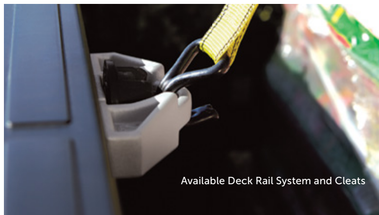
Available Deck Rail System and Cleats