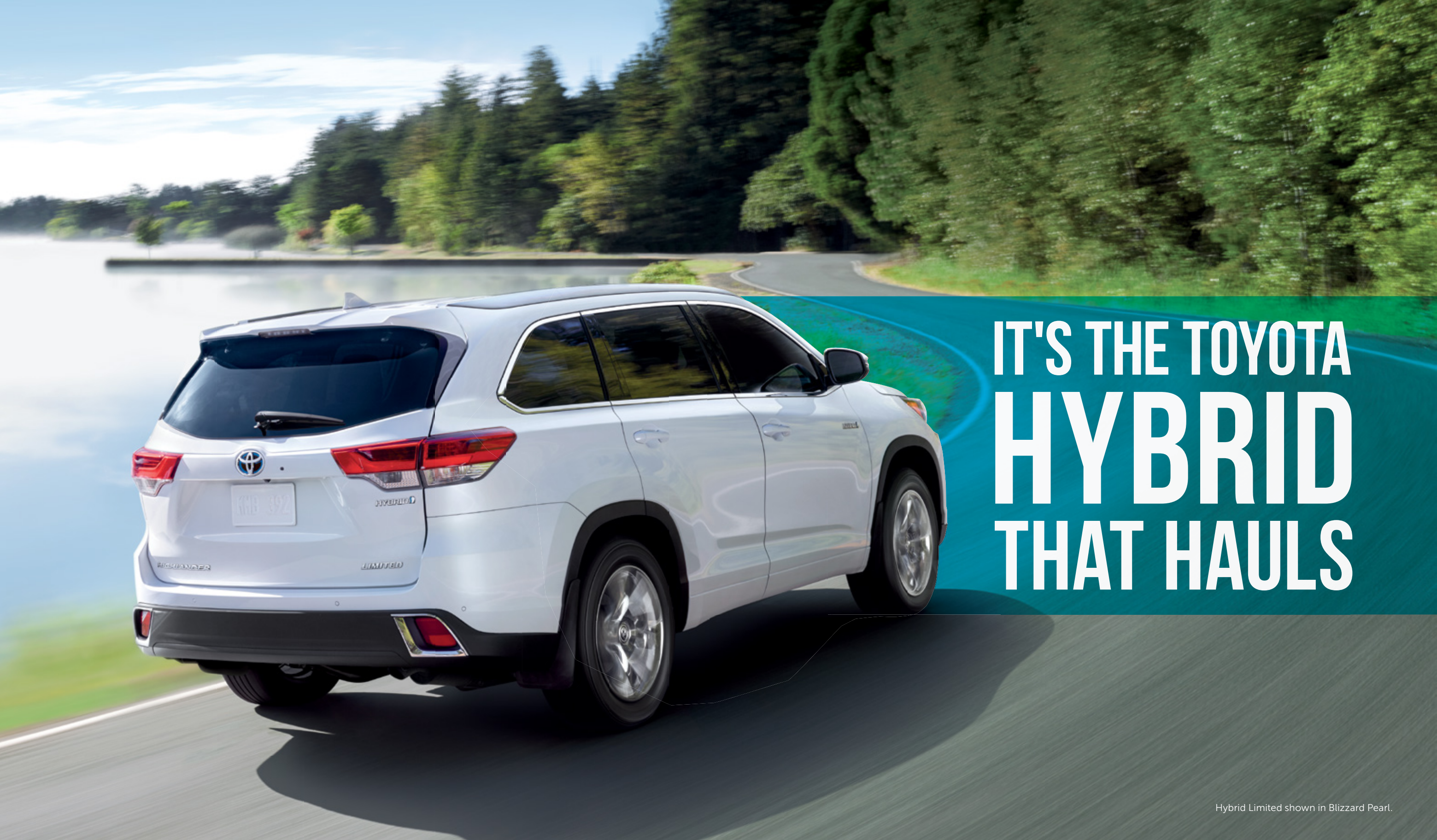
Hybrid Limited shown in Blizzard Pearl.

HYBRID SYSTEM INDICATOR Located in the instrument gauge panel is the Hybrid System Indicator, which provides the driver with a guideline to help optimize fuel efficiency.