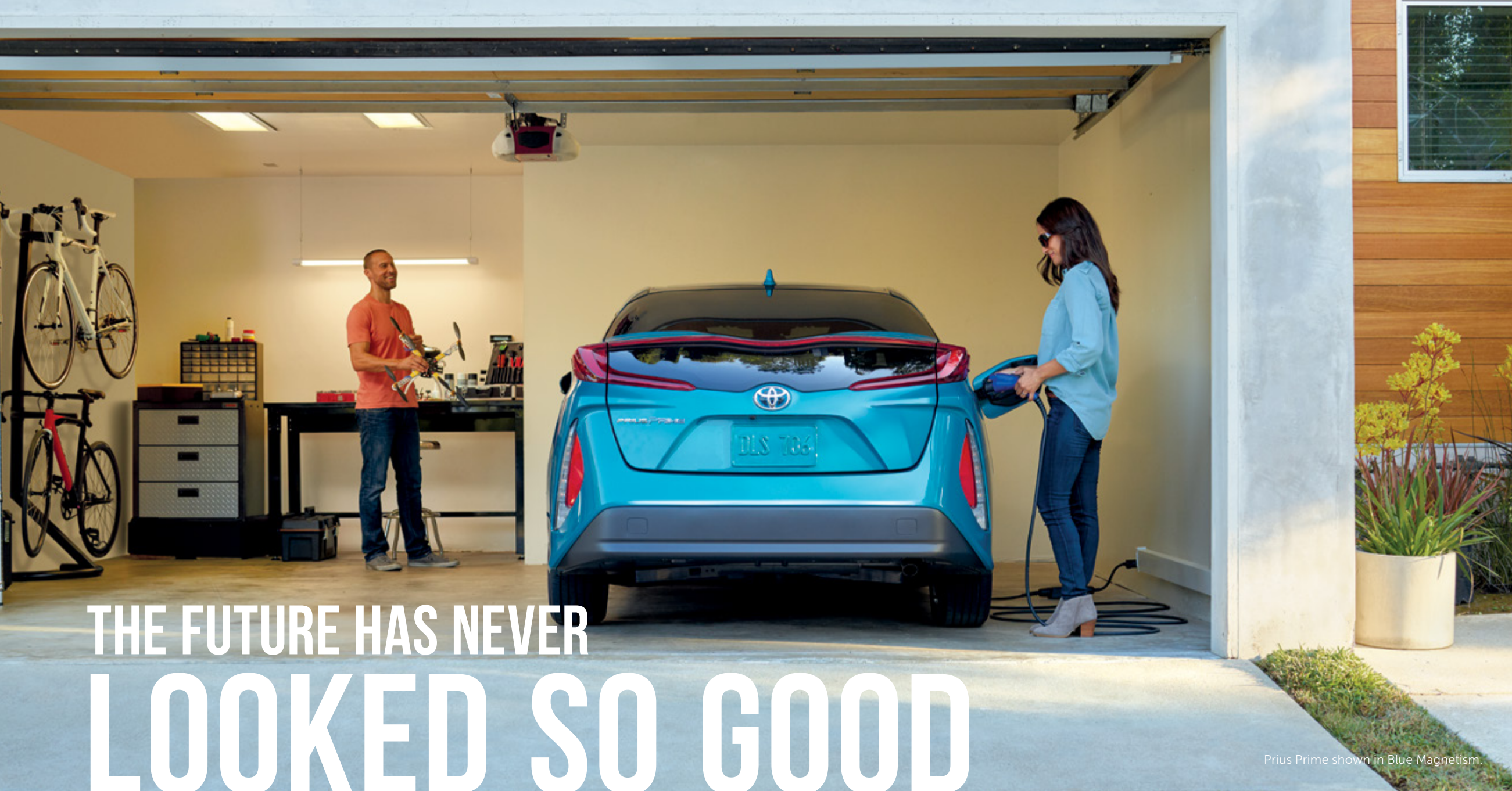
Prius Prime shown in Blue Magnetism.